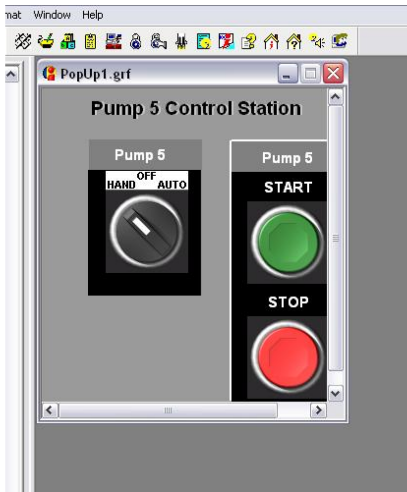
Fig. 1 Picture with scroll-bars.

In iFIX configure mode, open up the picture that is sized incorrectly. See Fig. 1.