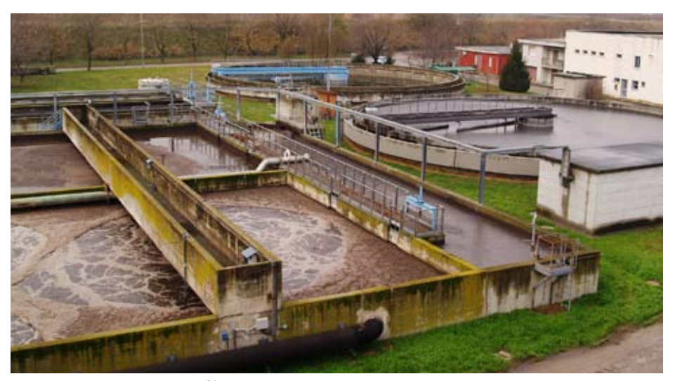
The Formellino plant purifies 1000 m³/hour of water diverting it from water flowing to the Lamone river.