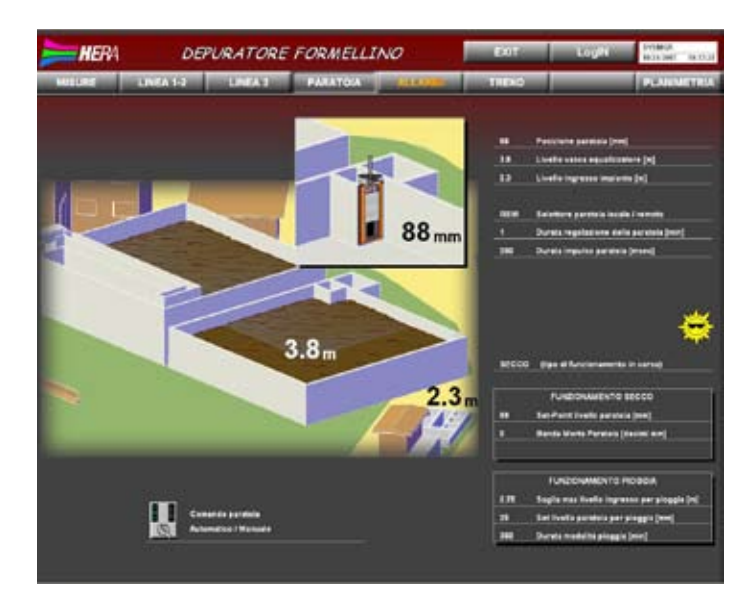
The water flow through the various stations of the water treatment plant is adjusted by controlling sluices.

The "peace of mind" Zanoni mentions was then to be translated into high plant availability and reliability, data access by operators and improved process management, in terms of better results and more efficient use of energy resources. In order to reach these goals, Hera called Pastorelli's Environmental Engineering firm to establish the project guidelines. The system was made by