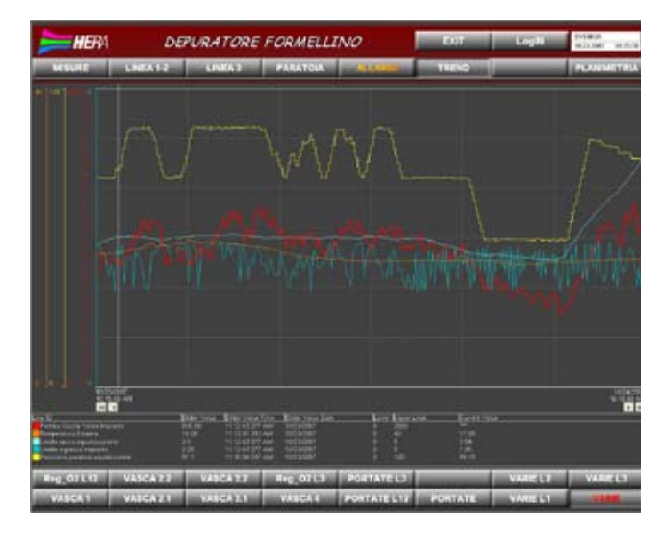
Intuitive displays show the plant status to operators at any given time

At the Formellino plant, a local computer running GE Proficy HMI/SCADA CIMPLICITY software collects, monitors and displays information and data, in the form of trend or log, in addition to alarms, which may be silenced or not by the users according to their access levels. Ten profiles corresponding to ten different operative and data access levels have been created according to the privileges established for each user class.