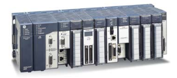
The "brain" of the system is a PACSystems Rx3i in redundant configuration which interfaces with the field instruments.

The "brain" of the system is a GE PACSystems RX3i in redundant hot backup configuration which interfaces with all the field instruments on a Profibus network (part optical fibres and part copper wires); there are several new and old sensors in total, amounting to approximately 600 controlled tags. The two redundant CPUs ensure the high plant availability required by the application criticality. The PAC Contoller establishes the standing times of the slurry in the various stages of the plant. By means of a direct Modbus/TCP link, the PAC communicates data to the Hera control room, where they are stored in a SQL database and concisely displayed so that the operator (present 24 hours a day) can be warned of faults and act accordingly.